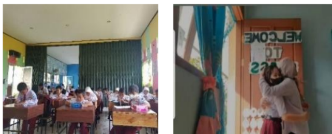
Figure 3. Learning with a Humanist Approach

With the application of learning with a humanist approach, students seem more active in expressing themselves and enthusiastic about school, so it has indirectly sought to meet the basic needs of learners. According to Maslow (2017), Basic human needs include; physiological conditions, a sense of security and comfort, love and affection, appreciation, a sense of freedom, and self-actualization.