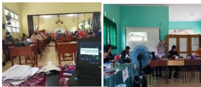
Figure 7. Technological Adaptation

Based on this, the result is that students better understand the use of cellphones, can better support their learning and provide motivation for teachers to be more creative in offering learning innovations. In addition, in utilizing the adaptation of technology using the WhatsApp application to coordinate and confirm to parents regarding student development and also the tasks that students must do at home. Technology adaptation also helps educators edit learning videos and video creation competitions commemorating the anniversary of the Republic of Indonesia and winning 1st place in the contest and creating a Tik-Tok video competition organized by the Ministry of Education and Culture.