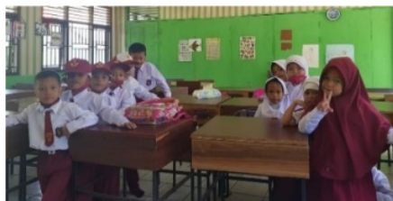
Figure 2. Implementation of Ice Breaking

atmosphere; providing icebreaking before and after learning. Ice breaking, as depicted in Figure 2, instills fun teaching concepts and increases students' enthusiasm to start learning today and tomorrow. Some of the content of ice breaking contains learning in the form of an introduction to English. This ice breaking is in the form of applause, salute patting, pat love, applause thanks, pat great children, pat WOW, dance banana, song if you like your heart, song open and close, pat one finger, one finger right guava tree, and so on. The provision of ice breaking can be an attraction for students in participating in learning. Before entering class, as seen in Figure 3, students can choose four ways to direct them to greet the teacher: high-fives, hugs, fists, and greetings, approaching, asking questions, and motivating students to be confident when doing assignments.