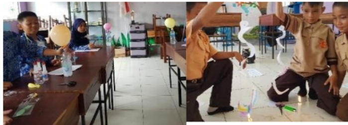
Figure 6. Experimental Activities

Experiment-based learning, as seen in Figure 6, aims to attract students' learning interest and discover basic concepts regarding experiments and observations of the processes carried out. Experimental activities do carry out two times in grade VI. First, the material of changing heat energy into motion, the implementation of this activity will invite students to cut the paper spirally. The ends are tied with threads and then placed on a burning candle so that the spiral kurta will show changes in motion so that students can conclude that fire can move an object. Second, develop a balloon using a mixture of baking soda and vinegar. In the implementation of this activity, students directly put baking soda into the balloon and vinegar in the bottle. After being ready, the balloon containing soda will insert into the end of the bottle, and slowly, the balloon does lift until the baking soda falls into the vinegar and raises the balloon. The result is the amount of baking soda can affect the small size of the balloon, so that the two experiments can provide a fundamental understanding of how an object reacts to one thing with another, this experimental activity can provide experiential learning about reaction changes. Of the course, students are more enthusiastic and interested because they are more directly involved in learning activities.