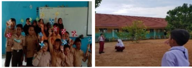
Figure 5. STEAM Activities

Experiment-based learning, as seen in Figure 6, aims to attract students' learning interest and discover basic concepts regarding experiments and observations of the processes carried out. Experimental activities do carry out two times in grade VI. First, the material of changing heat energy into motion, the implementation of this activity will invite students to cut the paper spirally. The ends are tied with threads and then placed on a burning candle so that the spiral kurta will show changes in motion so that students can conclude that fire can move an object. Second, develop a balloon using a mixture of baking soda and vinegar. In the implementation of this activity, students directly put baking soda into the balloon and vinegar in the bottle. After being ready, the balloon containing soda will insert into the end of the bottle, and slowly, the balloon does lift until the baking soda falls into the vinegar and raises the balloon. The result is the amount of baking soda can affect the small size of the balloon, so that the two experiments can provide a fundamental understanding of how an object reacts to one thing with another, this experimental activity can provide experiential learning about reaction changes. Of the course, students are more enthusiastic and interested because they are more directly involved in learning activities.