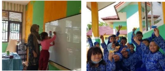
Figure 4. Application of PjBL and PBL

At the beginning of the teaching, students give a quiz session where children compete to come forward by writing the alphabet delivered by the teacher. Quizzes also provided for memorizing multiplication before going home. In grade 6, students make learning media about the solar system. It aims at honing their memory according to their respective works. In grade 5, students complete a mini version of the multiplication rod to utilize at home. The activity can train students to answer and listen to questions according to their hearing, vision, and work.