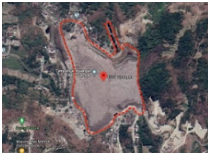
Figure 1. Piyungan Landfill.jpg 23K