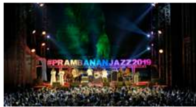
Figure 2. Prambanan Jazz offline concert