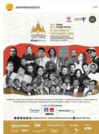
Figure 1. Prambanan Jazz 2020 Virtual Concert Poster

are not face-to-face directly, the feedback is automatically classified as indirect. Because there is an intermediary between the communicator and the audience. This process of change can be seen from the media convergence theory.