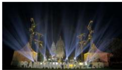
Figure 3. Prambanan Jazz Online Concert

The picture explains that there is a difference between virtual concerts and real concerts. It can be seen that there was no audience at the concert, this confirms that there has been a significant change in the visual performance of the concert. Therefore, the study of (Meikle & Young, 2012) showed that convergence theory is a process of becoming one or similar due to digitization. Therefore, physical characteristics that distinguish media include production, processing, and transmission. This convergence theory has been used as an argument for media