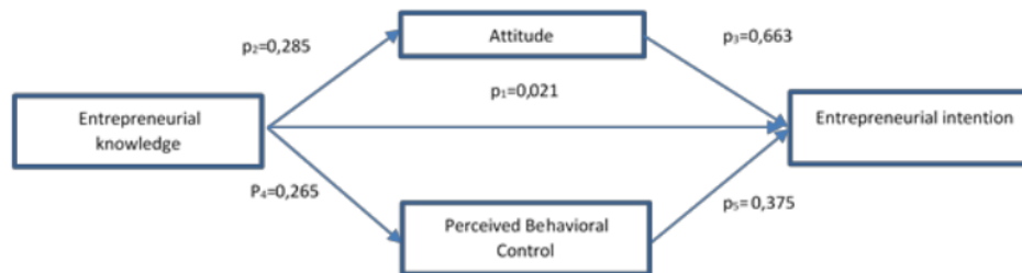
Figure 2 Path analysis

Based on Figure 2, the influence of attitude and perceived behavioural control variables as intervening variables of knowledge on intention can be determined. The indirect effect of knowledge on intention through attitude is: