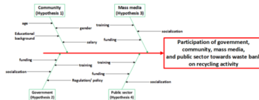
Figure 2. The diagram of participation of community, government, mass media, and public sector towards waste banks on recycling activity

To conduct regression method, SPSS 17.0 software was employed. The data firstly was analyzed using scatter plot to test heteroskedastic. This test was conducted to know whether there’s constant variance from all residual. The scatter 36 t graph was drawn between standardized predicted value (ZPRED) and standardized residual (SRESID). The x-axis shows the response variable and the y-axis presents the predictor variables. Fig. 2 presents the result of heteroskedastic test. It shows the data is random which means there is no heteroskedastic for regression model of response variable waste recycling activity.