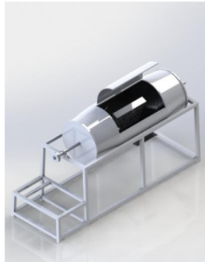
Figure 7 Concept Design 1

Based on the technical requirements, the following step is to generate concept. Generating concept would be a crucial point in QFD method, as it would be a decision whether one design could help to answer the customer's needs or not. In this research, there are 2 Design Concept that have been generated, as it is shown in Figure 7 and 8 Below