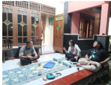
Figure 4 Interview Process 2 (at Home)

The result of the second interview is shown Table 2 below