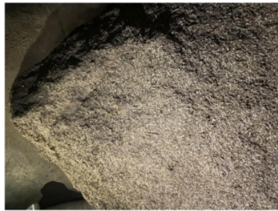
Figure 5 Concentrated Food

The second respondent have changed the feeding process for the goat using only dry food and concentrate, although there are several times that the goat still being fed with grass and greenery. The concentrate being used by the second respondent is shown in Figure 5 below.