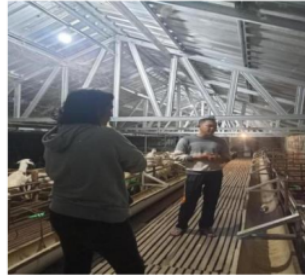
Figure 3 Interview Process 2 (at Farm)