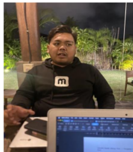
Figure 2 Interviewing Process of Waringi Farm's Owner

The first interviewing process is being held to the owner of Waringi Farm shown in Figure 2 below. As it shown in Table 1, the first respondent expressing several concern based on what have been asked by authors. It could be inferred from the first interviewing process that time or efficiency is the main factor as it is found that in one process of feeding preparation took couple of hours.