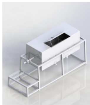
Figure 8 Concept Design II

The first concept design, provide several points that have become the concern by the breeder. The newly proposed design tool is provided with several improvement compared to the current process such as an enclosed process, stirrer and sufficient volume to feed the goats.