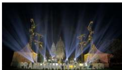
Figure 3. Prambanan Jazz Online Concert

The picture explains that there is a difference between virtual concerts and real concerts. It can be seen that there was no audience at the concert, this confirms that there has been a significant change in the visual performance of the concert. Therefore, the study of (Meikle & Young, 2012) showed that convergence theory is a process of becoming one or similar due to digitization. Therefore, physical characteristics that distinguish media include production, processing, and transmission. This convergence theory has been used as an argument for media