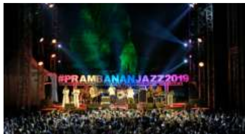
Figure 2. Prambanan Jazz offline concert