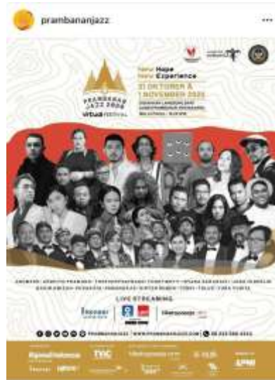
Figure 1. Prambanan Jazz 2020 Virtual Concert Poster

are not face-to-face directly, the feedback is automatically classified as indirect. Because there is an intermediary between the communicator and the audience. This process of change can be seen from the media convergence theory.