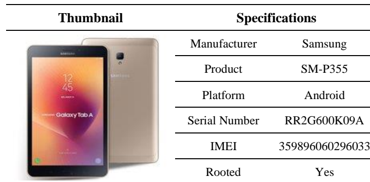
Table 3. Research Device Specifications

Table 3 shows the results of the identification of the mobile device used as a digital crime medium, namely a Samsung android smartphone with serial number SM-P355 and already in a rooted state.