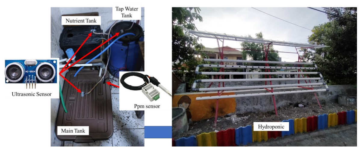
Fig. 1. The automatic hydroponic system with water quality control.

As the key of good dissolved nutrient control lies in the accurate reading of the PPM, the reading correction of the PPM sensor is necessary. In this research, the reading correction methods are divided into three steps, which are data collection, regression, and error calculation, as shown in Fig. 2. The collected data comes from a several samples of salt water with different PPM, which come from solution of tap water and kitchen salt There are five samples, such as 309 PPM (1 table spoon of salt), 290 PPM (2 table spoon of salt), 762 PPM (4 table spoon of salt), 1910 PPM (8 table spoon of salt) and 2420 PPM (15 table spoon of salt). First, a standard PPM meter (TDS meter 0-9999 PPM) measures the samples and the reading serves as the standard reading. The amount of the diluted salt depends on the PPM meter reading. If the reading increment is not significant compared to the previous, then the salt is still added. The samples are normally distributed between 375.35 PPM to 1901.05 PPM with confidence level of 95%, which includes the optimal PPM value for growing Lettuce and Bok Choy using hydroponic method [35]. Table 1 shows the samples statistical analysis.