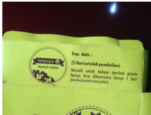
Fig. 4. Font form expired date information on the packaging

The typography used in Bakpia Djogja's packaging design is divided into two parts. The logo uses custom fonts or, in design terms called decorative fonts, while the fonts for packaging information use standard fonts to be easily read by consumers both from far and near distances.