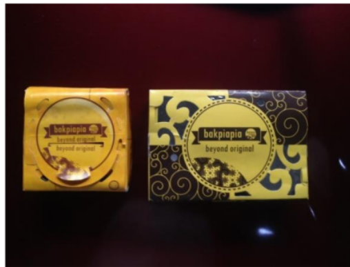
Fig. 3. Color packaging Bakpia Djogja