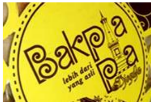
Fig. 5. Font shape on the Bakpia logo

If attention to the typographic logo used, there are Java elements and a few elements of Europe. The aim is to differentiate products because the typography used by competitors is almost the same. Based on that, Bakpia Djogja innovated the logo to be something different compared to competitors.