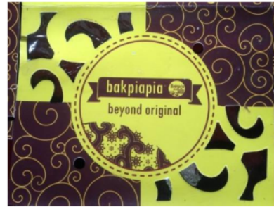
Fig. 8. Placement of the slogan on Bakpia packaging