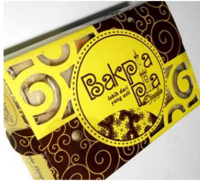
Fig. 6. Transparency on Bakpia Djogja's packaging topside

The color is dominated by a combination of yellow and brown with product information and packaging logo. On the top side, there is the transparency of packaging with plastic. Make the bakpia in it look a little.