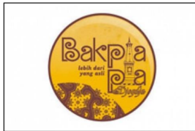
Fig. 2. Bakpiapia Djogja logo

Bakpiapia Djogja logo in full round shape there is a Bakpiapia Djogja writing using decorative fonts. The emphasis on the two letters "P" wants to show that Bakpiapia has two products, namely bakpia single or bakpia and bakpia blateran or pia. The logogram icon element is replacing the letter 'i' with the image of the Jogja monument. Jogja monument as a representative symbol of the city of Jogja as the city of origin Bakpia.