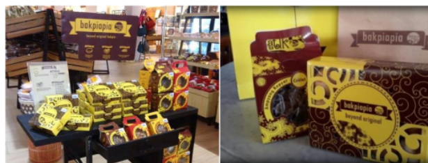
Fig. 7. Various forms of Bakpia Djogja packaging display

The segmentation is also targeting young people who are identical to new things. With prices that are a little more expensive than other competitors, consumers get something more than original Bakpia, namely Bakpia's innovative products and exclusive packaging. So Bakpia tries to communicate that Bakpia is more than the original.