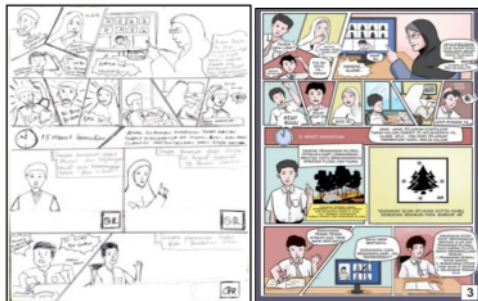
Fig.1. The design of the storyboard and the final results by incorporating AR marker elements

The resulting comics encourage the ability to understand knowledge and reason about natural phenomena using relevant theories. This competence is relevant to the science literacy [11]. The fundamental competencies achieved are analyzing climate change and its impact on ecosystems and writing ideas about tackling the problem of global warming. The indicators measured can explain the definition, causes, and effects and describe efforts to encounter the global warming [14]. Design is a design in the form of an initial storyboard using a sketch. The initial storyboard (a sketch) design is then made into a comic using Clip Studio Paint, as shown in Fig. 1.