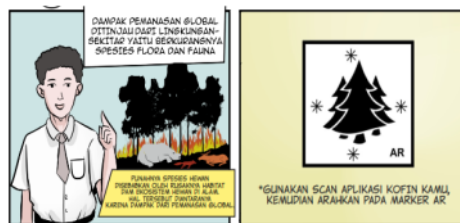
Fig.2. The sample of the dialogues related to marker.

Scanning the marker will bring up the global warming phenomenon following the learning objectives. Fig. 3 shows the video that appears as an AR phenomenon in the form of a 3D video. With a simple design and focus on core concepts and theories about global warming, students have a learning experience. In this video, students can repeat, move markers, and see from various directions to show interest in this material.