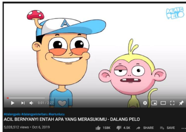
Figure 2: One of the Videos from the Dalang Pelo's Channel which has more than 5 Million Viewers