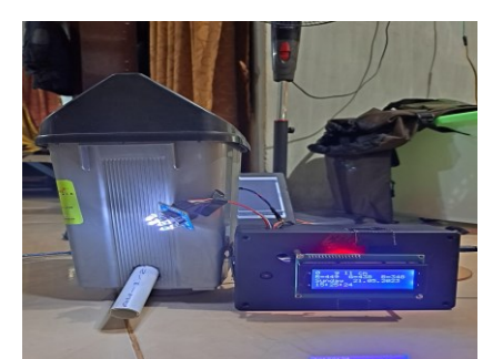
Fig. 6. Design results of the cat feed

This hardware design has several sensors and has a task according to the commands made in the program, and this device uses a plastic box. This device is arranged in a plastic box and a pipe in which it functions to put and remove cat food. The final hardware design is described in Fig 6.