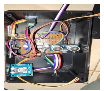
Fig. 5. Hardware tool set results

Fig. 4 is the result of a circuit that is arranged or connected between components and sensors using cables to connect to each other and put in a neat black plastic container. Hardware tool set results shown in Fig. 5.