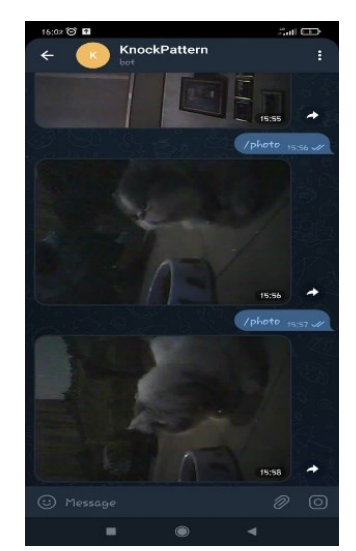
Fig. 10. ESP32CAM sensor sending image results on telegram

Furthermore, the results of the ESP32CAM sensor are used as a camera to determine the presence of cats and cat activities connected to the telegram application on a smartphone by photographing an image. ESP32CAM sensor sending image results on telegram shown in Fig. 10.