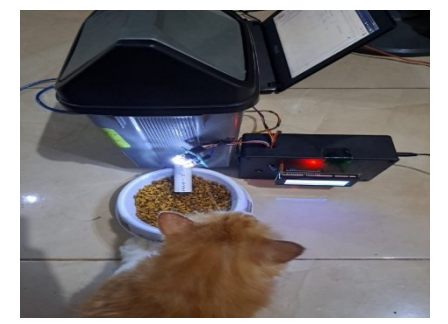
Fig. 9. White color reading result

Vol. 9, No. 3, September 2023, pp. 758-767