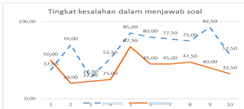
Figure 2: Error rates for pre-test and post-test