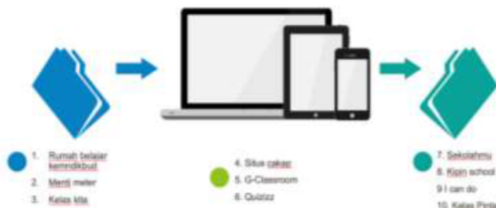
Figure 1. Learning applications used in Muhammadiyah Yogyakarta elementary schools

Based on the table above, the most widely used learning applications are the Ministry of Education and Culture's study house, Mentimeter, our class, the chat site, google classroom, quizizz, your school, kipin school, I can do and smart class. Among these applications, the most frequently used are Google Classroom and the Ministry of Education and Culture's learning house.