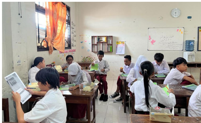
Figure 2. Working on group following the worksheet

Students were grouped and assigned activities during the learning sessions according to their respective worksheets (See Figure 2). Each student was allowed to use The Meta Quest 2 VR headset to explore and engage with the virtual animal habitats. The VR-based curriculum covered various topics related to animals, such as their habitats, movements, physical characteristics, sounds, and accompanying text explanations. The VR technology allowed students to move freely between different animal habitats and observe them at their own pace.