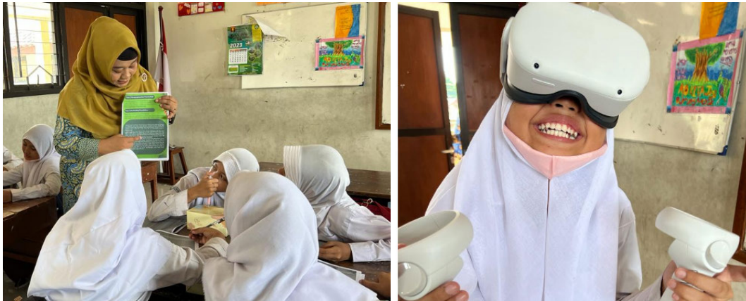
Figure 1. Preparation activities: Introductory session