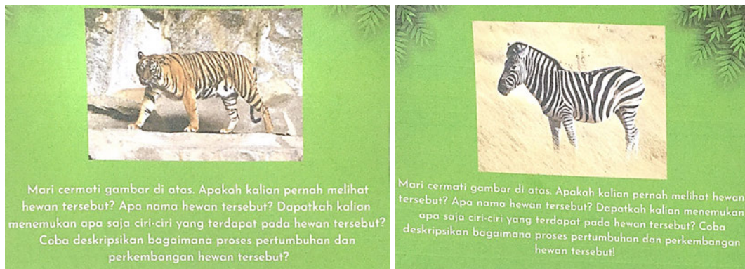
Figure 3. The assignment to identify the animal characteristics after using VR