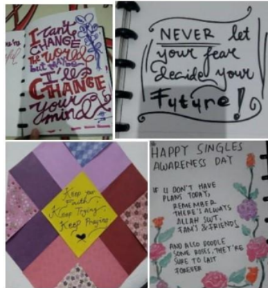
Fig. 2. Farah's creation of doodles

In another snapshot of her literacy practice that she shared with me on WhatsApp message service, Farah produced doodles that she drew and posted on her personal blog which was also linked to her Instagram story as seen in Figure 2.