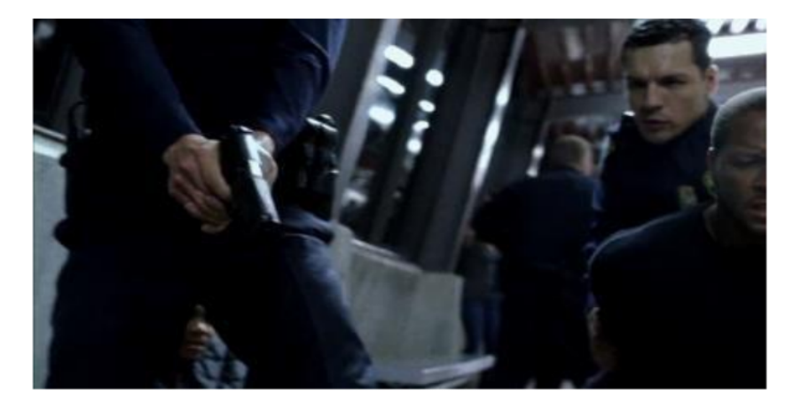
Scene 5.1 (minute 01:04:30): Extermination Dialogue 4.5: Extermination