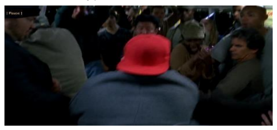
Scene 4.1 (minute 59:52): Physical Attack Dialogue 4.1: Physical Attack

In this study, physical attack means offensive behavior against a certain racial group that is physically and materially detrimental. In this movie, many scenes show physical attacks from white people to African-Americans, which can be interpreted that there is racial discrimination in the form of physical attacks.