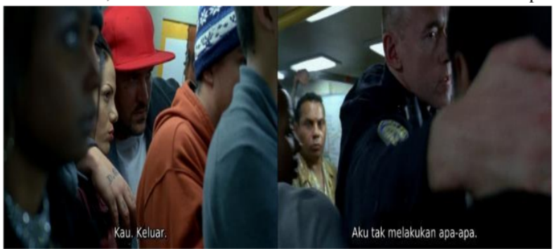
segregate African-American as listed below:

Segregation in racial discrimination is the behavior of excluding certain racial groups from getting their rights; or getting fair treatment when they have a personal or general business. In this movie, there are several scenes show that there are still white people who