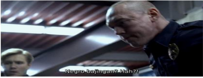
Scene 1.3 (minute 01:04:03): Verbal Antagonism Dialogue 1.3: Verbal Antagonism

After Cale and Oscar got out of prison, they accidentally met in the train wagon, Oscar was suddenly called by Cale and at that moment Cale scorned and dared Oscar with harsh words like "niggas". Actually, Oscar did not pay attention to Cale's ridicule because Oscar has other important matters, but Cale continues to cause a ruckus with Oscar and ended up with Cale hitting Oscar for no apparent reason. It can be concluded that there is racial discrimination in the form of verbal antagonism depicted in this scene.