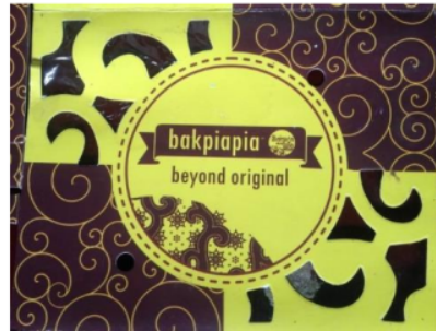
Fig. 8. Placement of the slogan on Bakpia packaging