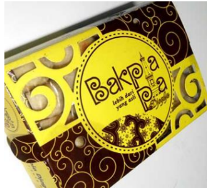
Fig. 6. Transparency on Bakpiapia Djogja's packaging topside

The color is dominated by a combination of yellow and brown with product information and packaging logo. On the top side, there is the transparency of packaging with plastic. Make the bakpia in it look a little.