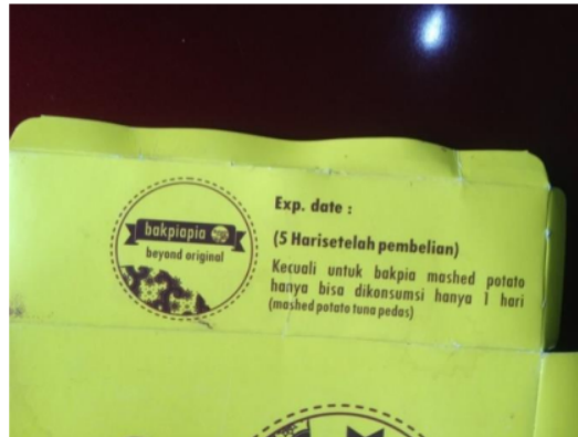
Fig. 4. Font form expired date information on the packaging

The typography used in Bakpiapia Djogja's packaging design is divided into two parts. The logo uses custom fonts or, in design terms called decorative fonts, while the fonts for packaging information use standard fonts to be easily read by consumers both from far and near distances.