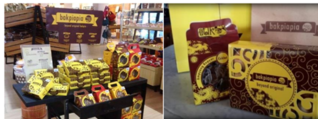
Fig. 7. Various forms of Bakpiapia Djogja packaging display

The segmentation is also targeting young people who are identical to new things. With prices that are a little more expensive than other competitors, consumers get something more than original Bakpia, namely Bakpiapia's innovative products and exclusive packaging. So Bakpiapia tries to communicate that Bakpiapia is more than the original.