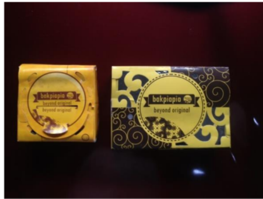
Fig. 3. Color packaging Bakpiapia Djogja