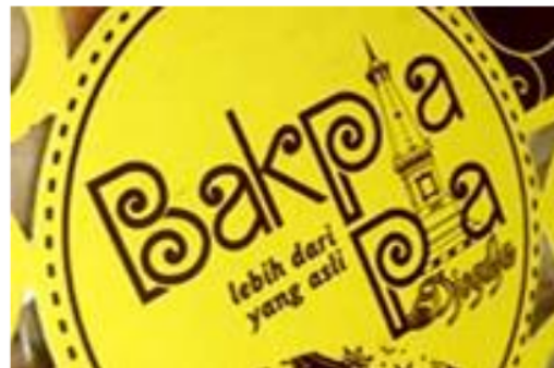
Fig. 5. Font shape on the Bakpiapia logo

If attention to the typographic logo used, there are Java elements and a few elements of Europe. The aim is to differentiate products because the typography used by competitors is almost the same. Based on that, Bakpiapia Djogja innovated the logo to be something different compared to competitors.