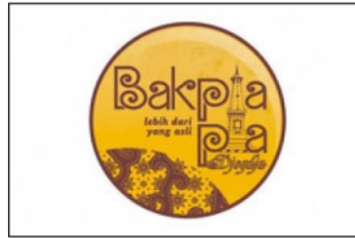
Fig. 2. Bakpiapia Djogja logo

Bakpiapia Djogja logo in full round shape there is a Bakpiapia Djogja writing using decorative fonts. The emphasis on the two letters "P" wants to show that Bakpiapia has two products, namely bakpia single or bakpia and bakpia blateran or pia. The logogram icon element is replacing the letter 'i' with the image of the Jogja monument. Jogja monument as a representative symbol of the city of Jogja as the city of origin Bakpia.