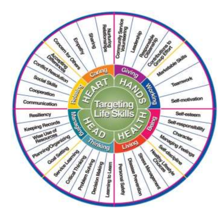
Figure 2. Life Skills Targeting