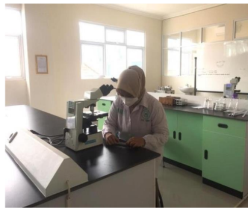
Figure 2. Fungal culture was carried out at the Microbiology Laboratory. Over 70 specimens, only six can be cultured using the Media Sabouraud Dextrose Agar (SDA)

The inclusion criteria are official scavengers at Sukawinatan's TPA, residents of the work area, and willing to participate in the research by signing informed consent. The exclusion criteria were respondents who did not complete the questionnaire and received treatment in topical antifungals in the last week and oral antifungals in the last month; and a history of allergic contact dermatitis.