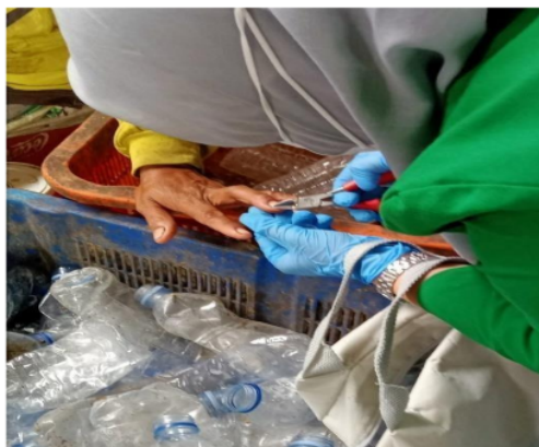
Figure 1. The skin scraping was performed in the scavenger's house. seventy specimens were prepared with KOH 20% before being confirmed with microscopical examination

The cross-sectional analytic observational studied from October 2022 to January 2023. The research took place at Sukawinatan's final disposal field in Palembang City. The population of this study was respondents suspected of having Tinea Pedis and Onychomycosis. Permission clearance number obtained from the Dinas Lingkungan Hidup dan Kebersihan , 070/053/DLHK/2022. The number of samples used was 70 respondents according to the inclusion and exclusion criteria. Ethical clearance number obtained from the Faculty of Medicine Universitas Muhammadiyah Palembang, 015/EC/KBHKI/FK-UMP/XI/2022.