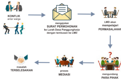
Figure 1. Flow Chart of the Panggungharjo Village Mediation Institute (Aji, 2019)

Referring to the Panggungharjo Village Mediation Institute, the existence of a similar establishment mediation institute in other regions or villages is very possible and applies to the Wukirsari Village area. So, what is needed next is how the institutional model will be formed according to the conditions and situations in Wukirsari Village.