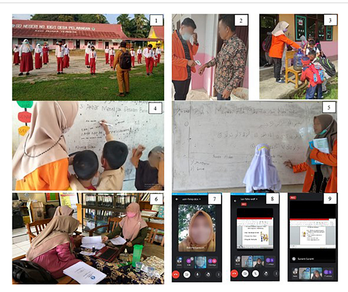
Picture 1. Teaching campus student task setting at the State Primary School 106/I Paralayang, Batanghari, Jambi. 2. Application of health protocols. 3. Behavioral change education in washing hands for COVID-19 prevention. 4. Literacy and numeracy support. 5. Koranic literacy enrichment (QS. Al-Ikhlas [122]: 1–4). 6. School administration. 7. Students enable teachers to teach online via zoom with a smartphone. 8. Students show a presentation material slide, which is explained by the teacher. 9. Students accompany the teachers teaching online using a smartphone.

students who had followed these activities if it was not converted to SKS. (Respondent 9)