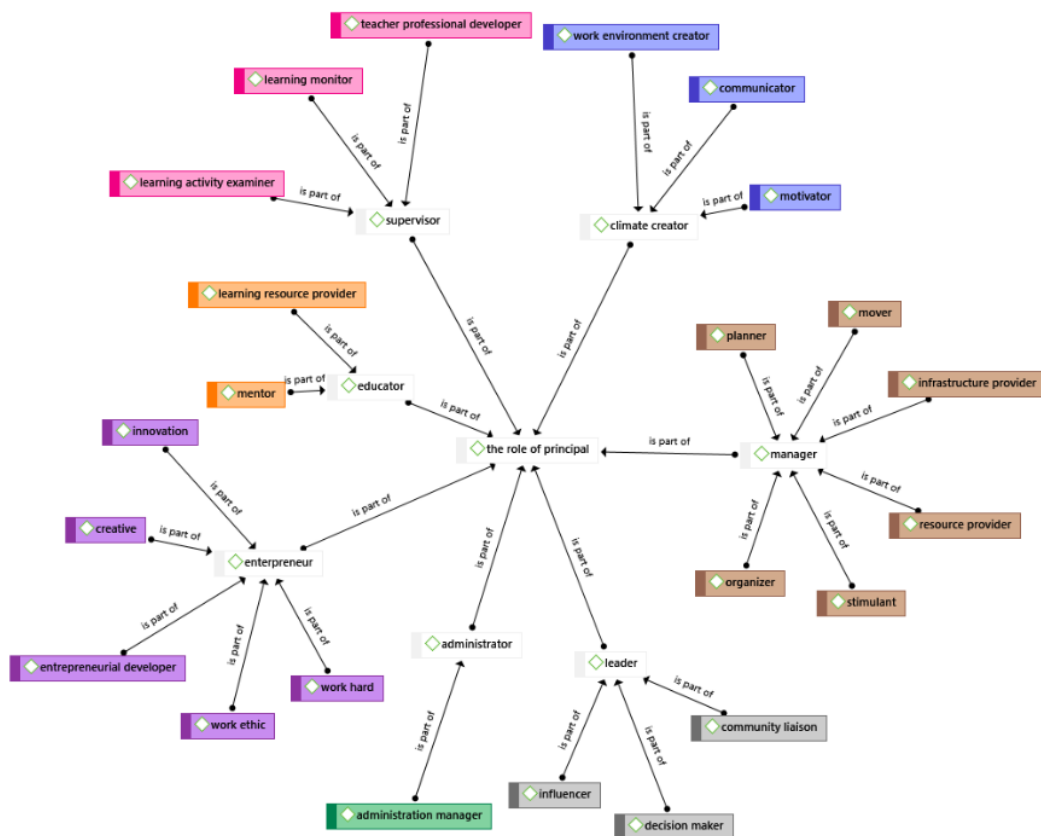
Fig. 2: Results of Data Analysis of the Role of Principals in Vocational Schools