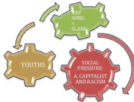
Figure.1. The Smart Graphic of Rap Song Relation to Youths' Social Background

Rap Song is a fantasy of all sweet escaped for youths and the platform for them to voice out their current psychology resulted from inner or social pressure. Rap language helps them to opt out. The moment the speakers practice the slang it is relatable to youth also reinforce their identity as a fresh and free spirit human being. More than that historical background that slang existences is to break language hierarchy was also be the basic reason why slang is always progressive