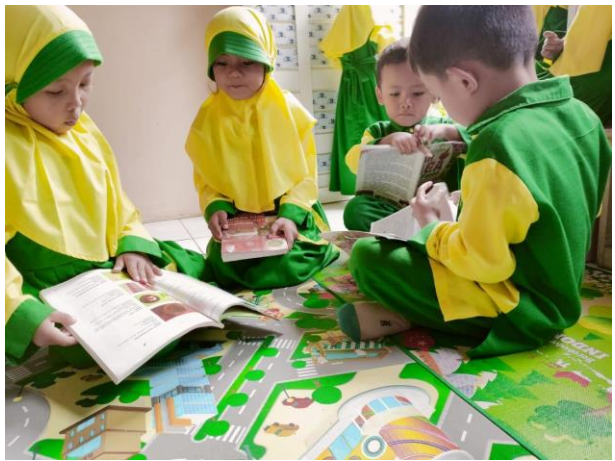
Figure 1. Children's activities following the movement of reading books together

The principal is able to direct his teachers to increase their students' interest in reading through reading activities together with all students (Together Reading Movement). This reading together movement activity is carried out once a month by inviting pusling (library keeling). The school principal entered into an MoU with the mobile library, so that this activity ran smoothlyar. This reading together movement has had an impact on students' interest in reading, including: children become enthusiastic about reading with the various types of books provided, children become more interested in reading books available in the mobile library.