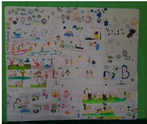
Figure 2. Children's work in the form of comics

The principal directs the use and mobilization of all teachers and students to be actively involved in implementing literacy culture, the results of documentation in kindergarten institutions