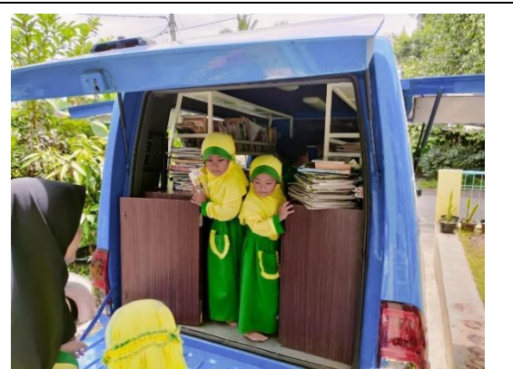
Figure 4. Children's activities when the keeling library arrives