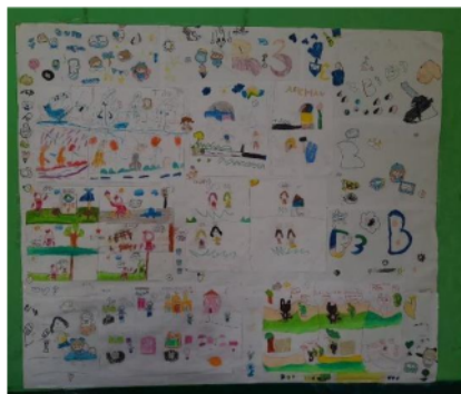
Figure 2. Children's work in the form of comics

The principal directs the use and mobilization of all teachers and students to be actively involved in implementing literacy culture, the results of documentation in kindergarten institutions