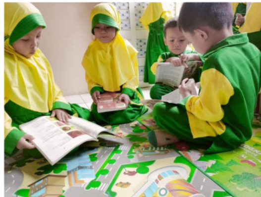
Figure 1. Children's activities following the movement of reading books together

The principal is able to direct his teachers to increase their students' interest in reading through reading activities together with all students (Together Reading Movement). This reading together movement activity is carried out once a month by inviting pusling (library keeling). The school principal entered into an MoU with the mobile library, so that this activity ran smoothlyar. This reading together movement has had an impact on students' interest in reading, including: children become enthusiastic about reading with the various types of books provided, children become more interested in reading books available in the mobile library.