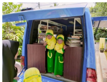
Figure 4. Children's activities when the keeling library arrives