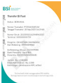
bukti bayar.jpeg 84K