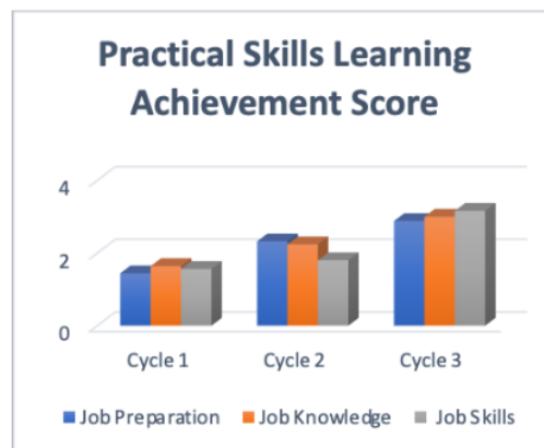
Figure 3. Improving practice learning achievement

Application of learning model explicit instructions can be implemented well by