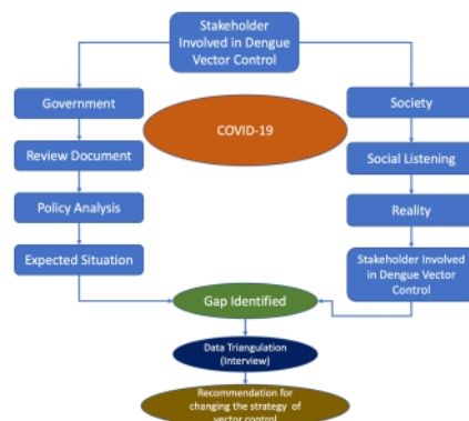
Figure 2 The developed framework used during the research.

center and health office, who was responsible for vector control in society and bridged communication to the health office related to proper dengue intervention in a particular area.