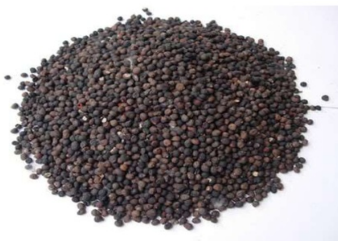
Figure 1 Kapok seed

kapok seed used researched are in figure 1 as follows: