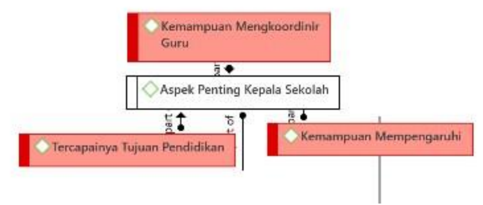
Figure 2: The Role of the School Principal in the Formation of Religious Character

various concrete steps, including improving teacher quality as the main key, namely by organizing training courses to improve teacher competitiveness, school learning models and sustainable learning outcomes.