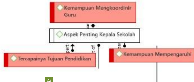
22 Figure 2: The Role of the School Principal in the Formation of Religious Character

various concrete steps, including improving teacher quality as the main key, namely by organizing training courses to improve teacher competitiveness, school learning models and sustainable learning outcomes.