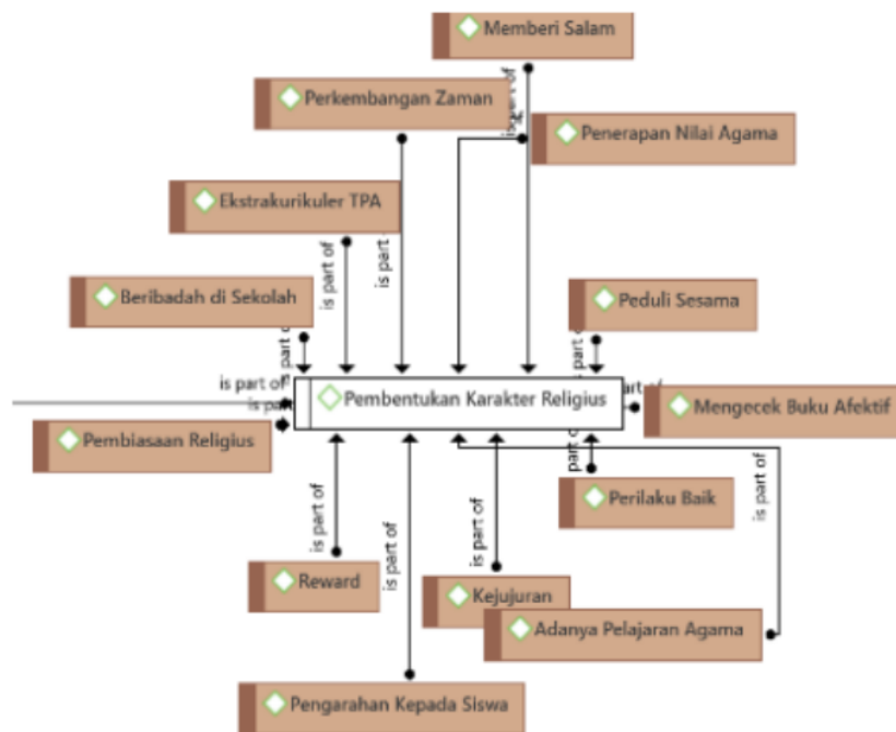
Figure 1: Formation of Religious Character