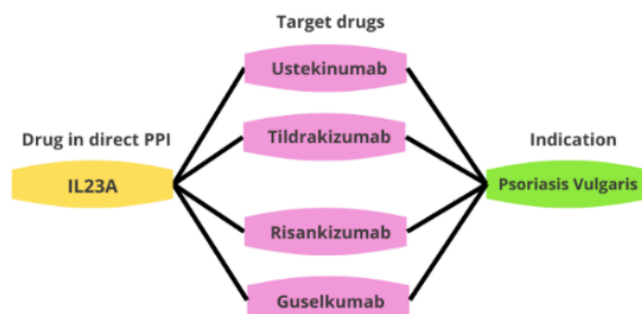
Figure 3. Relationship between psoriasis vulgaris risk genes and available drugs for psoriasis vulgaris.

New drug candidates for psoriasis vulgaris were mapped to the Drugbank to find candidates for psoriasis vulgaris drugs. From the search results in the Drugbank, by entering 24 genes and 96 drug targets, it was found that two genes were used for psoriasis. Those that have been approved for psoriasis vulgaris disease have been clinically approved are the Interleukin-23A (IL23A) gene, and the drug targets consist of ustekinumab, tildrakizumab, risankizumab, and guselkumab ( Figure 3 ).