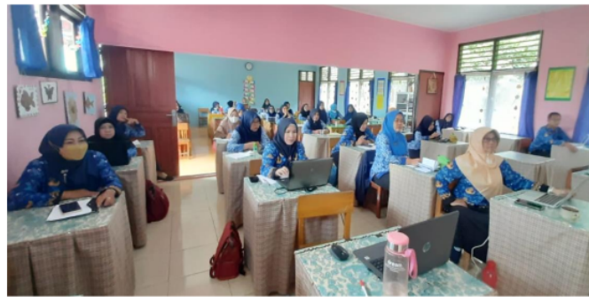
Figure 3. The teachers participate in the training to improve their skills

The efforts begin with quickly adapting to and accepting changes. The teachers engage in self-development through training and technical guidance, as illustrated in Figure 3. They also share their perceptions of innovative solutions for integrating ICT into learning, such as using smartphones in their schools. The aforementioned statement concludes that the teachers are capable of addressing problems associated with the rapid development of ICT.