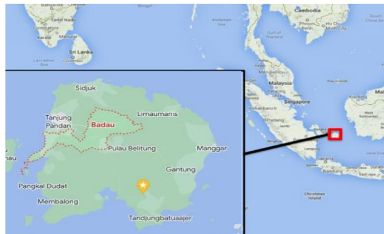
Figure 1. Location of Badau Village on Belitung Island

The research spanned from April to November 2022, with fieldwork in schools conducted from October 2 to November 2, 2022. The study involved three elementary schools: Public Elementary School 1 Badau, Public Elementary School 2 Badau, and Public Elementary School 3 Badau. These schools are situated in the hamlets of Badau I, II, and Kelekak Datuk, within the village of Badau, in the Badau sub-district of Belitung Regency, with the postal code 33451, in the Belitung Islands Province (refer to Figure 1).