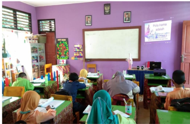
Figure 2. Learning activities in class using ICT

The teachers who use ICT in learning have good professional competence so they can present a combination of ICT tools not only to meet administrative needs but present them to the students in the learning process (Figure 2).