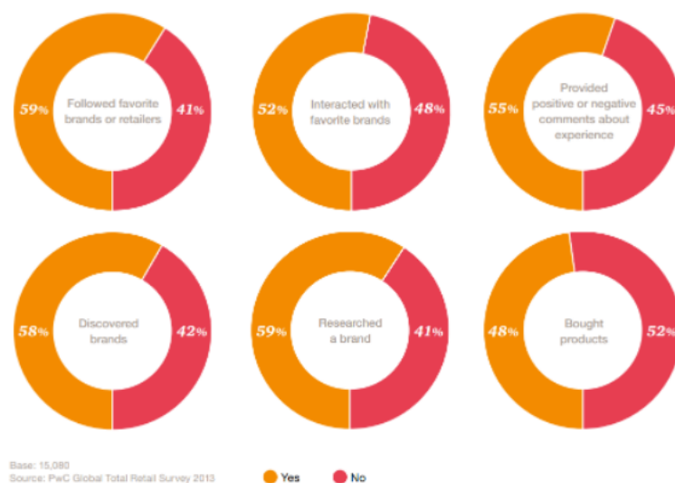
Fig 3. Social media influences the brands

As per a survey by (Montgomery, 2014) average of 45% of global consumers expect brands to offer customized products and experiences. This reflects the demand for personalization, which is one of the key factors shaping motives and behavior in the disruptive era.