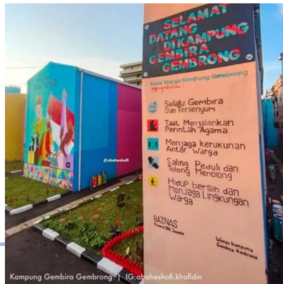
Fig 4. One of @aniesbaswedan's Instagram posts five days after the declaration of his presidential candidacy - October 8, 2022 (source: instagram.com/aniesbaswedan ).