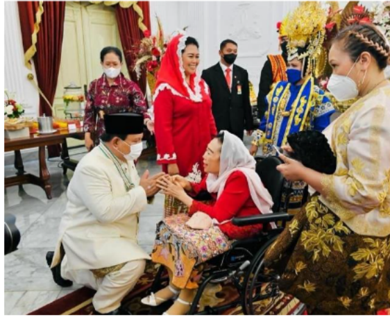
Fig 2. One of @prabowo's instagram posts five days after the declaration of presidential candidacy - August 17, 2022.

On the fifth day of posting, Prabowo uploaded photos of himself with several popular political figures, namely with President Jokowi, Golkar Party Chairman Airlangga Hartarto, Coordinating Minister for Maritime Affairs and Investment Luhut Binsar Pandjaitan, and with Sinta Nuriah Wahid and Gus Dur's daughter (figure 2).