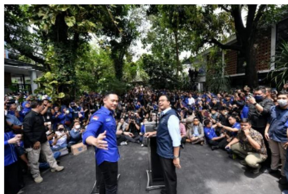
Fig 5. One of @aniesbaswedan's Instagram posts four days after the declaration of his presidential candidacy - October 7, 2022.

The post that also received many likes and comments was the fourth day's post with a difference of 147 comments from the fifth day's post. The fourth day's post featured 10 photos containing a meeting between Anies Baswedan and Agus Harimurti Yudhoyono along with the DPP of the Democratic Party. One of the visuals of the fourth day's post can be seen in Figure 5, complete with a long text explaining the photo in question.