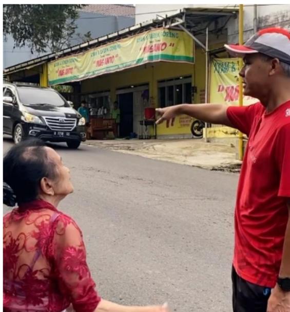
Fig 7. One of @ganjar_pranowo's Instagram posts four days after the declaration of presidential candidacy - April 25, 2023.

A post that also received a lot of public reaction was uploaded on the fourth day. The post used a video format containing Ganjar's activities while running but was interrupted by a grandmother who invited him to talk for a moment. The post managed to get the most comments totaling 4,255. In the video, the grandmother praises Ganjar several times and hopes he becomes the next President of Indonesia. Many agreed with the grandmother's words in the comment section, but not a few disagreed with them. Those who disagree consider the post a set-up to make Ganjar's image as a leader more visible. The visual of the fourth day's post can be seen in Figure 7.