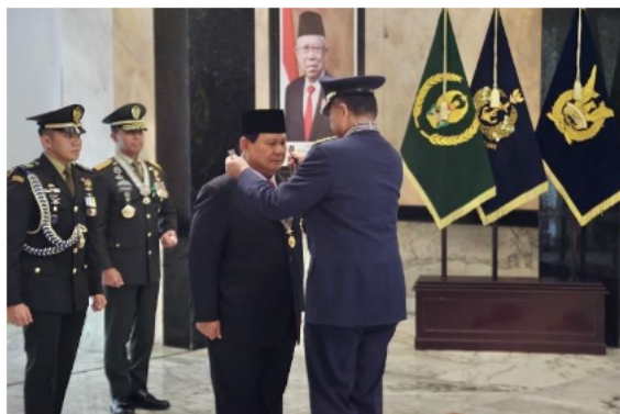
Fig 3. One of @prabowo's instagram posts three days after the declaration of presidential candidacy - August 15, 2022 (source: instagram.com/prabowo ).

From the content aspect, Prabowo's third day post is a form of public appreciation for Prabowo as a former military man. From the content analysis of the comments on this post, many people gave appreciation and congratulations on the awarding of 4 honors to Prabowo. The number of congratulations to Prabowo strengthens his branding as a retired soldier. One of the visual uploads related to the awarding is presented in figure 3.