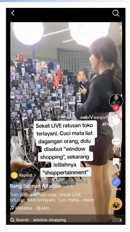
Figure 3. Multicam Live Shopping Practice Screenshot

Van Dijk mentioned that the CMC concept can be used in the global flow of the economy both in the flow of production, distribution, and consumption. By referring to the characteristics of new media, CMC can support a company to move and develop flexibly and efficiently by interacting through new media. The presence of new media greatly provides fresh air to the economic world by creating new industries that involve big players with media network designs (Schumann, 2013) that suits their respective businesses. The concept conveyed by Van Dijk is very relevant to the presence of the live shopping model as the latest breakthrough from the marketplace. With the live shopping model, it can increase revenue for users of this feature, because with a limited time when live shopping takes place does not discourage buyers from shopping. In fact, the desire to spend on a limited duration is increasing. Likewise, the emergence of new opportunities that come along with live shopping such as Social Bread and multicam live shopping above.