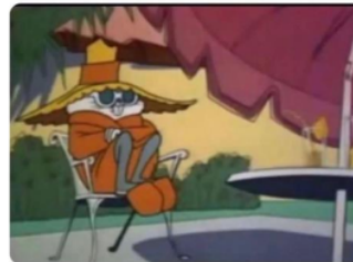
Figure 2. Instagram post from @mytherapistsays (March 7th, 2023)

The morning after an emotional breakdown: maybe I overreacted