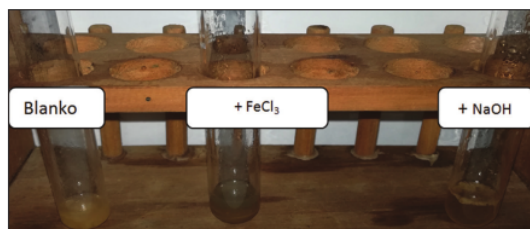
Fig. 2: The flavonoid and phenolic compound test of ethyl acetate extract of peanut shell

formation of blue-green color after adding \text{FeCl}_3 to the mixture of extract and 96% ethanol showed the presence of phenolic compounds in the extract.