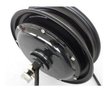
Figure 2. 2000-watt BLDC

Researchers chose the Brushless Direct Current (BLDC) electric motor of the various electric motors available. Motor type BLDC is used and installed in the rear frame and then connected with chains to drive the axle.