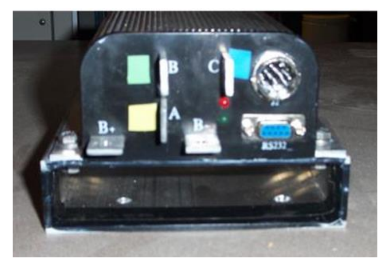
Figure 3. Kelly Controller KEB72451

According to (Wiberg, 2003), motor Normal DC is very easy for control speed and direction. For just enough speed control provide a variation of the input voltage. For change direction, simply reverse the polarity. Speed is often controlled by pulse width modulation for DC motors and Brushless motor. The controller is one part of the most vital BLDC motor, in which all the parameters input is processed at the this. Researcher chose Kelly Controller KEB72451 controller can be programmed to connect with laptop or PC and adjust according to taste spec (Suyitno, 2005; Suyitno, 2019). Peak Current, working voltage, throttle sensitivity, torque/speed mode, etc. One trivial but very functional thing is that this controller is equipped with a system for turning the motor into reverse (backwards and forward).