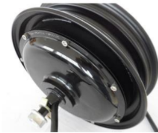
Figure 2. 2000-watt BLDC

Researchers chose the Brushless Direct Current (BLDC) electric motor of the various electric motors available. Motor type BLDC is used and installed in the rear frame and then connected with chains to drive the axle.