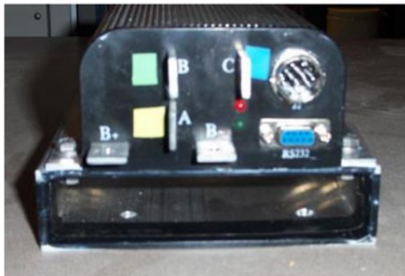
Figure 3. Kelly Controller KEB72451

According to (Wiberg, 2003), motor Normal DC is very easy for control speed and direction. For just enough speed control provide a variation of the input voltage. For change direction, simply reverse the polarity. Speed is often controlled by pulse width modulation for DC motors and Brushless motor. The controller is one part of the most vital BLDC motor, in which all the parameters input is processed at the this. Researcher chose Kelly Controller KEB72451 controller can be programmed to connect with laptop or PC and adjust according to taste spec (Suyitno, 2005; Suyitno, 2019). Peak Current, working voltage, throttle sensitivity, torque/speed mode, etc. One trivial but very functional thing is that this controller is equipped with a system for turning the motor into reverse (backwards and forward).