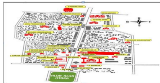
Figure 1: Plan of the Pedestrian Area of Malioboro Street

Nowadays, after 248 years, Malioboro street is very crowded and busy because there are many street vendors, artists, tourists and locals shopping and enjoying the city. They walk, sit and watch angklung art performances, culinary hunting or doing cultural and historical tours.