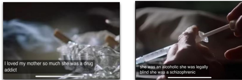
Picture 3. 1 (1.16-1.25) Scene Homeless due to drug addiction

According to the National Coalition for the Homeless, homeless persons are more likely to suffer from substance misuse than non-homeless people. In many cases, substance misuse is caused by the stress of homelessness, not the other way around. Many people start using drugs or alcohol to deal with the difficulties of homelessness. This is demonstrated through the interactions of the characters in the film, which are built through the existing scenes, namely, scene