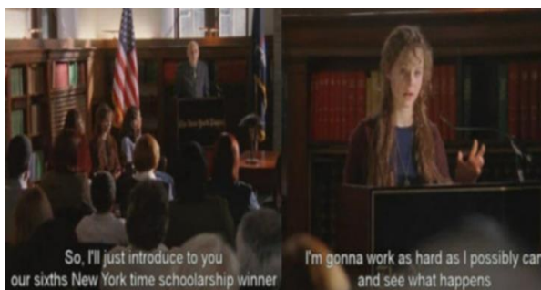
Picture 3.6 Scene Need of Power (1.22.23)