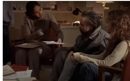
Picture 3.5 Scene Need of Affiliation (56.10)