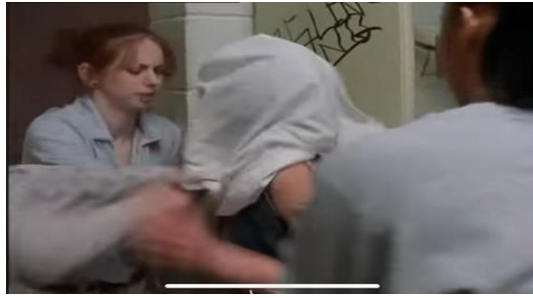
Picture 3. 4 Scene(2.30-2.45m) Homeless due to domestic violence (source : https://youtu.be/O0vbIvUSVaA?si=6Hv2ZUQ728jRvBxT )