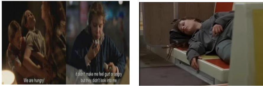
Picture 3. 2Scene (6.20 & 36.50m) Homelessness due to economic factors

"Homeless to Harvard," where the main character couldn't afford proper food, decent clothing, and even had to sleep at the bus station.