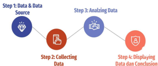
Figure 1. Steps of Data Collection and Analysis