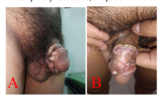
Figure 4. Wounds on the penis after two weeks therapy (A) and after one month therapy (B)

The patient was diagnosed with perianal condyloma acuminata and recurrent herpes simplex with a secondary infection of Streprococcus agalactiae . Patients received therapy trichloroacetic acid six times, then electrofulguration for condyloma acuminata and acyclovir 400 mg three times a day, clindamycin oral 300 mg three times a day, erythromycin cream twice a day after compressing NaCl 0.9% for 15 minutes. After receiving therapy, the wound on the penis got better, but before the wound completely recovered, the patient did not visit anymore (Figure 4).