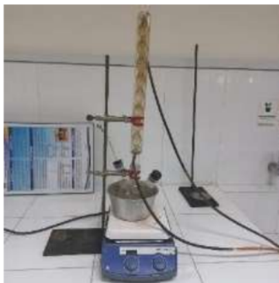
Fig.1 Leaching equipment set

This step was conducted for extracting metals, especially iron from nickel slag. The research was conducted based on the previous research method that has been done [8]. The leaching process was carried out using equipment that depicted in the Figure 1. The equipment comprised a three-neck flask assembled together with a magnetic stirrer, thermometer, stand, and upright cooler. Process leaching was done by mixing 60 ml sulfuric acid 2M with 15 g of nickel slag. Leaching temperatures used in the research was 100°C. The flask was immersed in the oil during heating process to reach a stable temperature. The experiment was conducted at various temperature and sulfuric acid concentration. that was based on several literatures which is based on the results of research conducted by previous researchers [8].