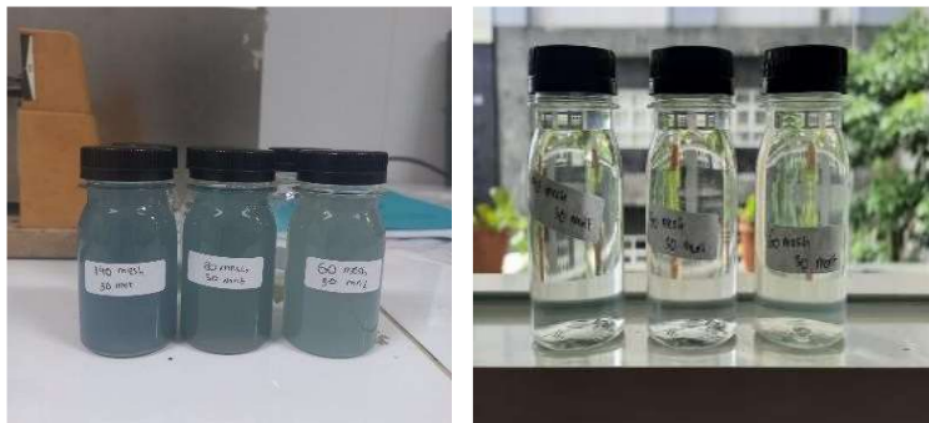
Fig.2 Leachate of nickel slag extraction (a) before destruction (b) after destruction

Leaching has been carried out for each sample variation and then the leaching results are first filtered using filter paper and then the results are put into each 50 ml sample bottle. The result of leaching process is depicted