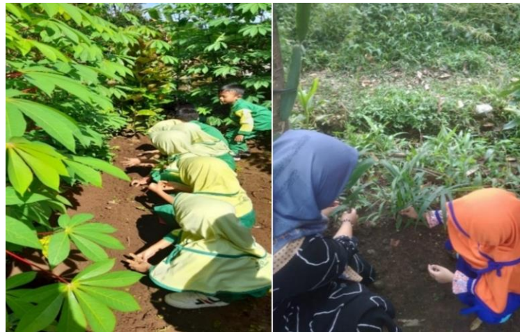
Figure 1. Outing class activities introducing students to indigenous flora

At the designated research site, educators have successfully incorporated optimal elements of differentiated instruction, including the establishment of positive environmental conditions that effectively foster students' engagement in the learning process and facilitate the cultivation of their competencies. The establishment of a collaborative and conducive learning environment is essential to fostering students' intrinsic motivation to acquire knowledge, thereby facilitating their holistic personal growth and development. The positive learning environment is conducive to the fulfillment of students' prosperity and inner and outer happiness. The findings derived from our observations indicated that engaging learning activities could stimulate students intellectually. Figure 1 illustrates outside-class activities aimed at familiarizing students with indigenous flora, including ginger, kencur (aromatic ginger), and lempuyang ( Zingiber aromaticum ).