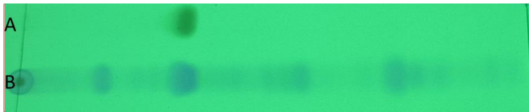
Figure 1. Thin layer chromatography analysis of quercetin standard (A) vs extract sample (B) with identical RF values, suggesting the presence of flavonoid quercetin in the ethanolic extract

previous studies (Heliawati et al., 2022; Puspita et al., 2019; Suri et al., 2021). In addition, a thin-layer chromatography test on the extract was also performed to ensure the flavonoid content as compared to the quercetin standard with a theoretical Rf value of 0.38 for identification (Kemenkes RI, 2017). The result showed that both the extract and the quercetin standard had the same Rf value at around 0.38, establishing the presence of quercetin in the extract (Figure 1). Ultimately, total flavonoid content (TFC) in EERBL was also determined via UV-Vis spectrophotometry using a quercetin standard with a result of 78.14 \pm 7.63 mg QE/g (n=5).