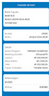
ijadis 1320.jpg 70K